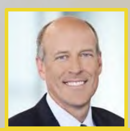
Chief Executive Officer 29 June 2023

We look forward to continuing our delivery of essential solutions across numerous end markets, whilst we maintain the highest standards in supporting our clients in the energy transition.